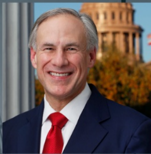
Texas Governor Greg Abbott