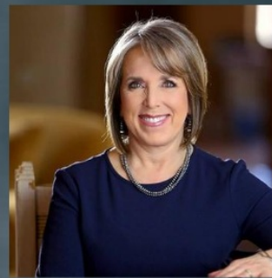
New Mexico Governor Michelle Lujan Grisham